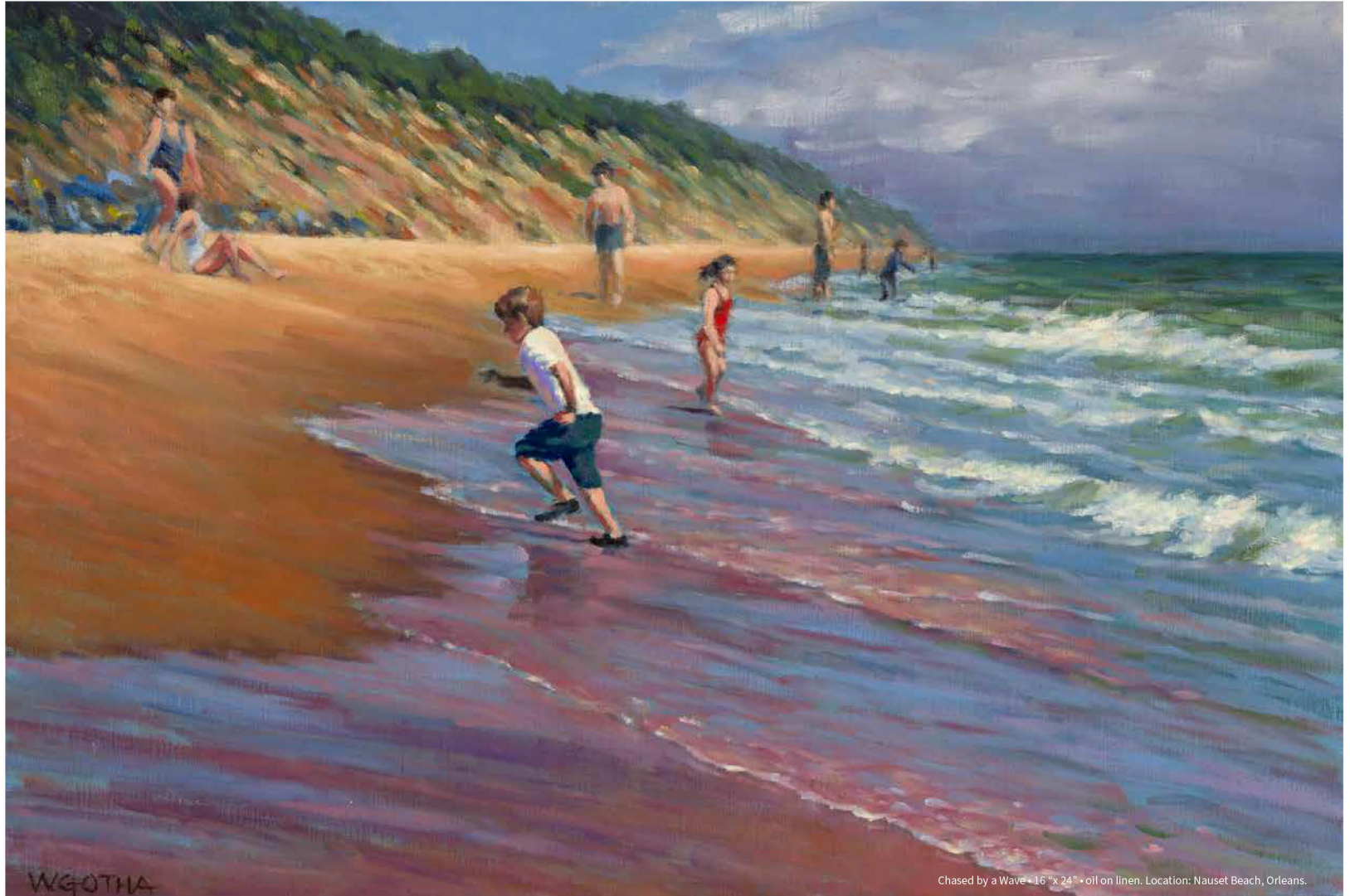
Chased by a Wave • 16" x 24" • oil on linen. Location: Nauset Beach, Orleans.