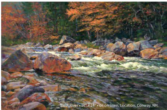
W. GOTHA Swift River • 16" x 24" • oil on linen. Location: Conway, NH.

"The Cape is a waterway," Gotha explains. "The ocean and the land interact so incredibly on the Cape because the elevation is very low. And so, you have these areas where the ocean comes into bays, or backs into rivers. And I've done