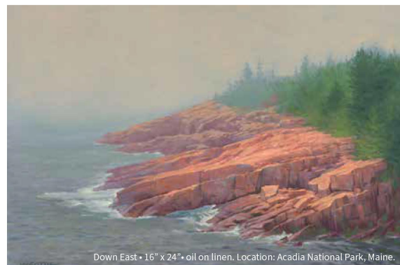
Down East • 16" x 24" • oil on linen. Location: Acadia National Park, Maine.

generates what I consider to be the perfect cropping of the scene. And in order to do that, I need time to think about it. So, when I get back to my studio from doing the color study, I bring out several different size canvases. I start sketching on them to see what it's going to take to hold this image that I've got in my head of that scene."