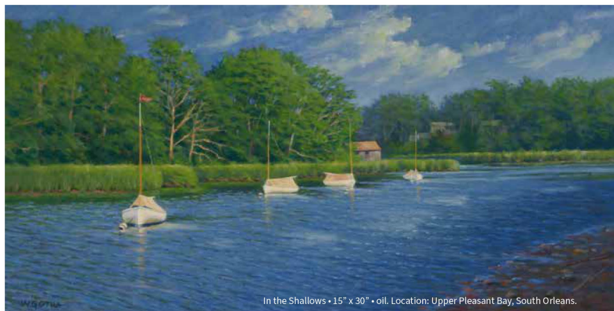
In the Shallows • 15" x 30" • oil. Location: Upper Pleasant Bay, South Orleans.

Massachusetts. And I really loved it. I just continued to paint all my life, and I took art courses when I could, and I resumed courses when I could. I painted on vacation, painted on business trips, painted any way that I could, anytime that I could," he recalls.